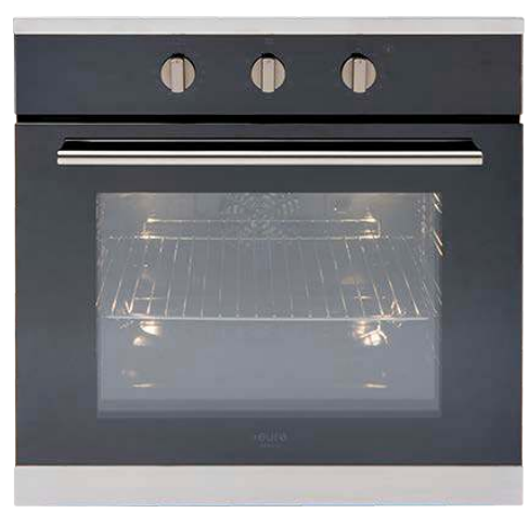
* Project model only