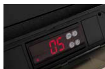
0 – 10 degrees electronic temperature control