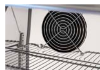
Recirculating internal fan