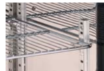
Chrome adjustable shelves