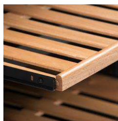
Telescopic rail + wooden shelves