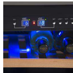
Computerized temperature control