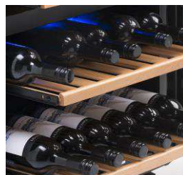
157 - 165 wine bottle capacity (750ml)